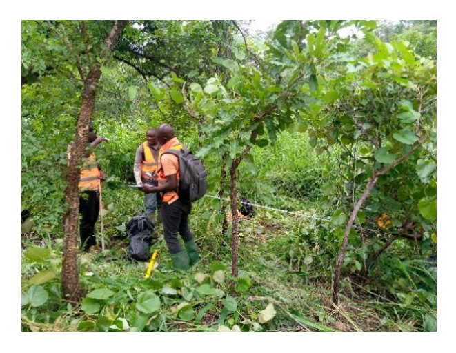
Figure 5 Field survey