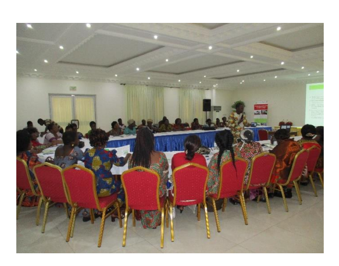
Figure 2 Participation of women in REDD+

The Figure 4 shows the major stakeholders. Vulnerable groups such as farmers, women and youth were also involved in the pilot projects (e.g., raising awareness of improved stoves and reforestation activities). Today, women continue to act on behalf of the vulnerability group. For civil societies and private sectors, capacity building took place.