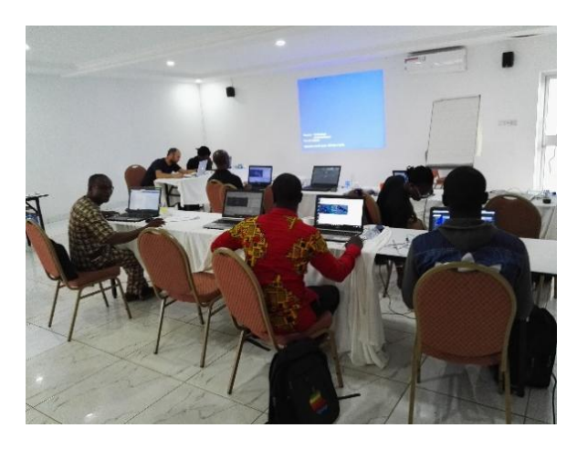
Figure 6 Training on satellite image analysis (provided by Togo government)