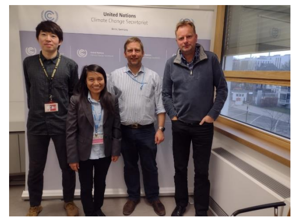
Photo of secretariat and experts participating in technical analysis of REDD+ results for Suriname

As part of the international consultation and analysis of BURs, the technical analysis of REDD+ results for Mexico and Suriname took place in January and February 2023, respectively. Mexico submitted its first REDD+ results against its modified FREL submitted in 2021 as part of the technical annex to its third BUR. Suriname simultaneously submitted its first and second REDD+ results against its modified FRELs submitted in 2018 and 2021 as part of the technical annex to its first BUR. Two REDD+ experts participated in each technical analysis session in Bonn and assessed the data and information provided by the