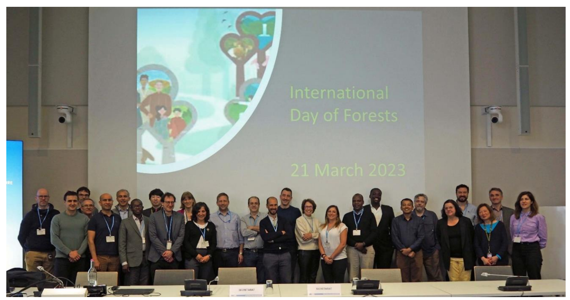
Group Photo at the technical assessment session in March 2023

You can learn more about the TA week from the video focusing on the experiences of experts!