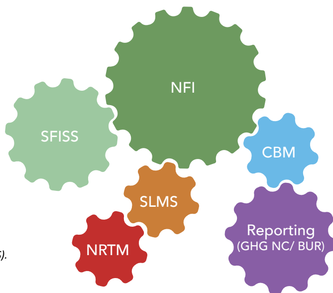
Components of the National Forest Monitoring System (NFMS).

The NFMS is perceived as a multi-purpose system (SBB, 2017), inherently including the Measurement, Reporting and Verification (MRV) system. Its main components are (Figure 2): the Satellite Land Monitoring System (SLMS) providing estimates of the activity data related to deforestation and forest degradation; the National Forest Inventory (NFI) providing estimates on Carbon Stocks (and emission factors related to deforestation); the Sustainable Forestry Information System Suriname (SFISS) component providing data on emission factors related to logging, timber production and the areas harvested; the Near Real Time Monitoring (NRTM) system that can provide timely alerts on unplanned changes in the forest, allowing for immediate action in the field; and Community Based Monitoring (CBM).