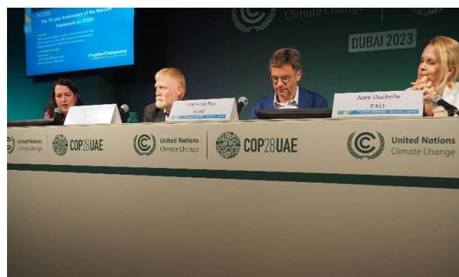
Figure 3 Panelists from the UK, Norway, FCPF and FAO

If you missed the event, you can watch the recording on the UNFCCC website and YouTube . UN Climate Change also published a news article on “ A Decade of REDD+: Notable Achievements by Forest Nations ”.