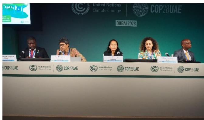
Figure 2 Panelists from Gabon, Indonesia, Suriname, Peru and Togo