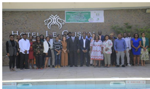
Figure 7 Photo of a workshop for REDD+ and Biennial Update Report

REDD+ efforts in Gabon greatly improved the quality of activity data, which contributed to the quality of Gabon's GHG inventory as well. To make consistency between the FRL and GHG inventory, Gabon applied the same methods to both calculations using the CfRN Foundational Platform calculation tool. This included applying the same land classes and Tier 3 approaches to estimate the emissions from forest degradation.