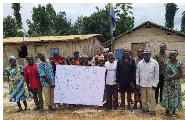
Figure 3 Photo with local community 1

Gabon's National Climate Council (Le Conseil National du Climat) compiled and analyzed the information on safeguards obtained from agencies. Safeguards information summary 3 was also prepared by this council.