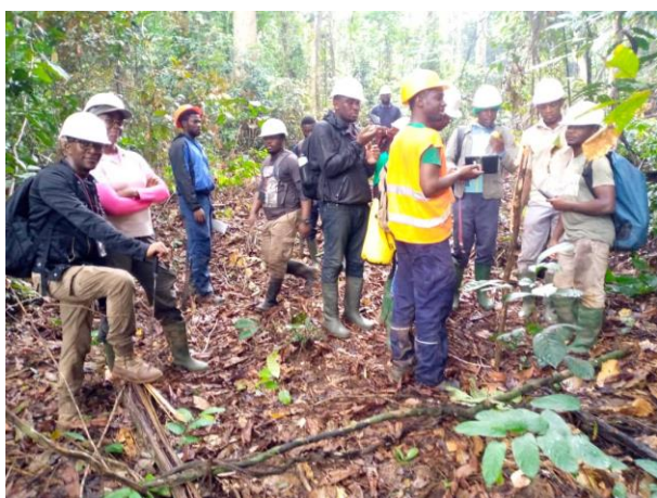
Figure 6 Photo of field survey

CAFI 1–3 contributed not only to finance, but also to REDD+ establishment and implementation.