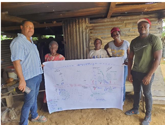
Figure 5 Photo with local community 2