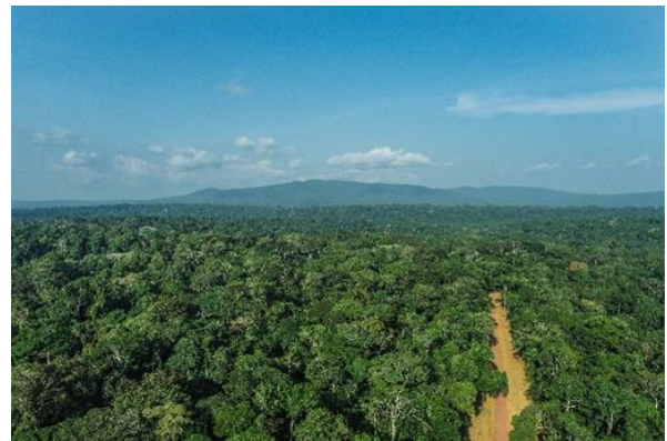
Figure 1 Forests in Gabon

A key REDD+ strategy in Gabon was " Plan stratégique Gabon émergent (PSGE) ". 1 One of the pillars of the strategy was "Green Gabon ( Gabon Vert )" indicating sustainable forest management, certified wood production,