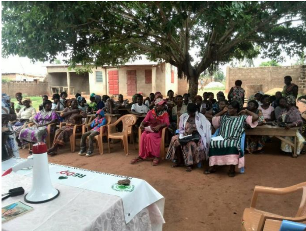
Figure 3 Communication with local communities