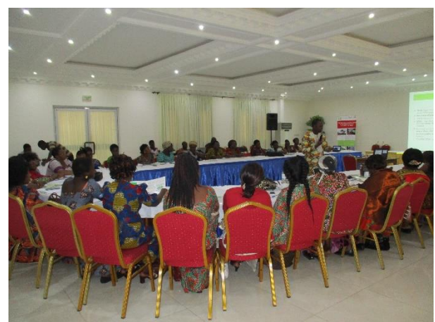
Figure 2 Participation of women in REDD+

The Figure 4 shows the major stakeholders. Vulnerable groups such as farmers, women and youth were also involved in the pilot projects (e.g., raising awareness of improved stoves and reforestation activities). Today, women continue to act on behalf of the vulnerability group. For civil societies and private sectors, capacity building took place.