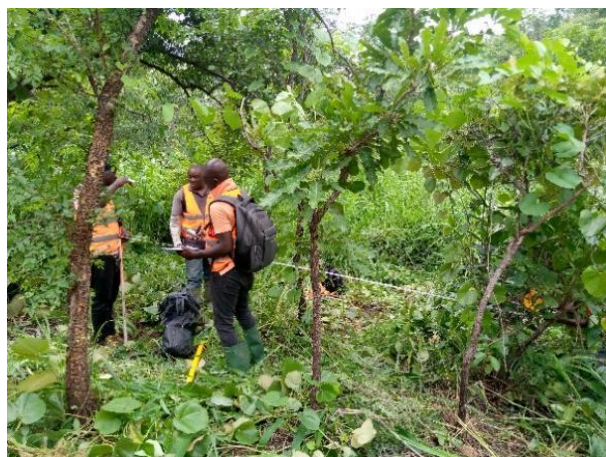
Figure 5 Field survey