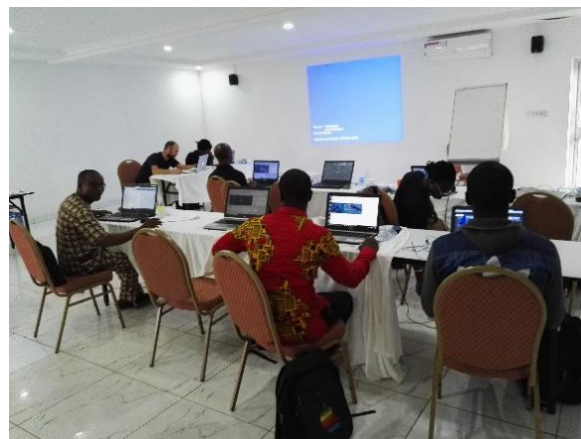
Figure 6 Training on satellite image analysis